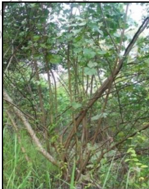
Figure. 1 Hibiscus tiliaceus

Hibiscus tiliaceus ( Hibiscus tiliaceus L malvaceae ) is a small tree of 3 – 10 meters high with spreading top, smooth or grooved and gray or brown bark. Its pink with scattered white inner layer is tough and can be easily peeled off. The single leaves are heart-shaped with wide base; the flowers are in bunches while the fruits with short nibs are circular oval covered with thick hair and are inside loop cloves. The tree grows well along the seaside, brackish-watered rivers or canals like mangrove forests and it flowers almost all year round. [1]. In terms of use, the tree is ornamental while the trunk is used for fire or canoe making and in fishery and the bark is used for making rope. [2]