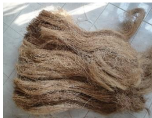
Figure 1 : Appearance of the fibers from the shaft Nypa Palm.

3.1 The experiments to separate the fibers from the shaft Nypa Palm of District of Village Paknaam Samut Prakan province the fiber through separation of fiber by means of beat and fibers of the fiber with a comb nails it. The fiber has a length of about 70 - 90 cm. the surface is not smoot and a rough and the fiber is very stiff. Because the fibers are combed with a comb nail carding.