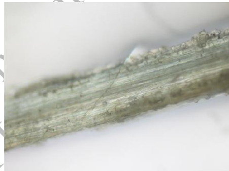
Figure 5 : The long section of the fiber