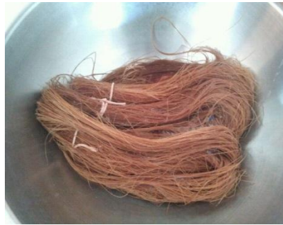
Figure 2 : The fibers from shaft Nypa Palm scouring process.

3.2 Experimental scouring process fibers from the shaft Nypa Palm of the fibers through a process of scouring, then the fibers are very soft. Not stiff and impurities such as dirt or mud on the surface of the fiber. Because of wetting agent, and Sunlight soap that enhances the softness to the fabric.