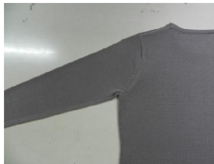
Figure9: Iron and Knitwear surface distance Figure 10: Seam must be ironed 1 cm to back