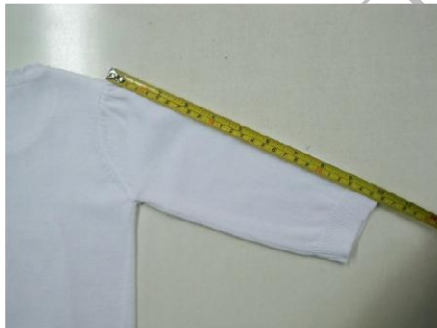
Figure 5 : Sleeve length