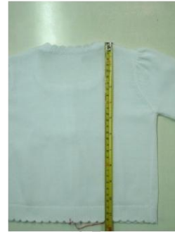
Figure 2 : Back length