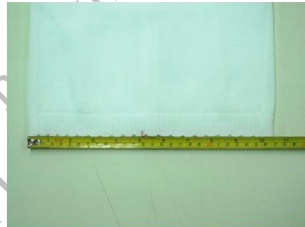
Figure 4 : Hem width