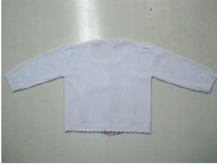
Figure 1: Prepare of sample to measure

specimens: Back length, Chest width, Hem width, Sleeve length, Sleeve hem width, Armhole width and neck width (Figure 1-8). Measurements of these parts were then made and record before ironing.