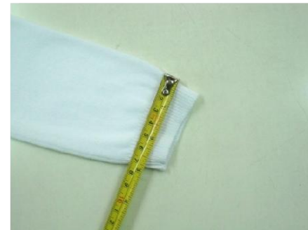
Figure 6 : Sleeve hem width