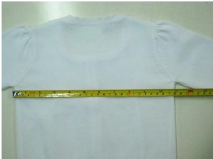
Figure 3 : Chest width