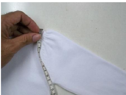
Figure 7 : Armhole width