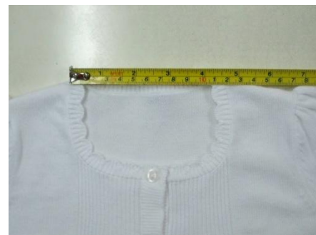
Figure 8 : Neck width